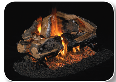
CHRRSO-2 Charred Rugged Split Oak See-Thru Log Set