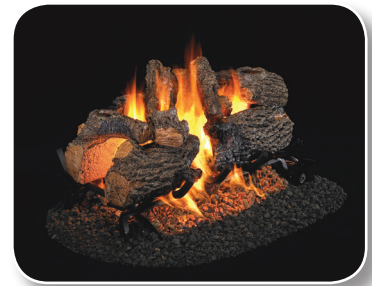
CHD-2 Charred Oak See-Thru Log Set