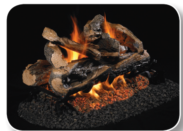
RRSO-2 Rugged Split Oak See-Thru Log Set