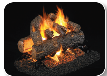
RDP-2 Golden Oak See Thru Log Set